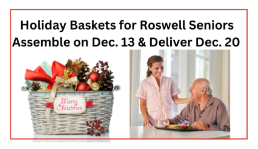
Sign up to volunteer to assemble baskets on 12/13 or help deliver on 12/20 at meeting.