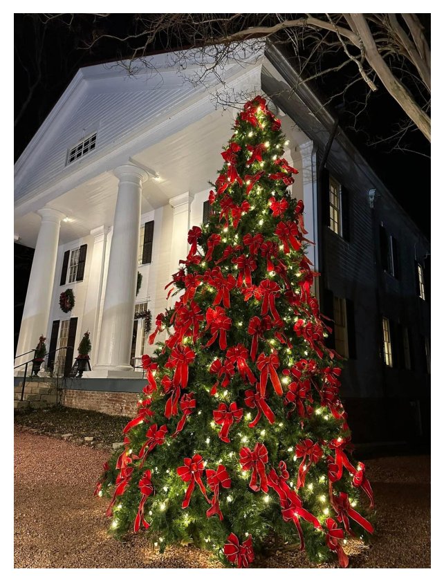
There are still a few shifts at ol' Bulloch Hall. Contact Karen Schwank or follow this QR code: