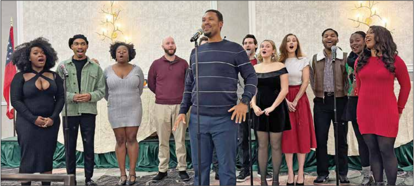
THE STRAND CHRISTMAS TRADITION SINGERS