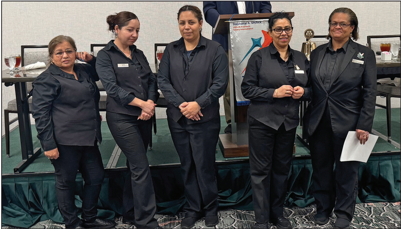
Merry Christmas from Rotary Club of Marietta to seven loyal servers and staff of the Hilton Conference Center who received $200 cash holiday gifts from Club members.