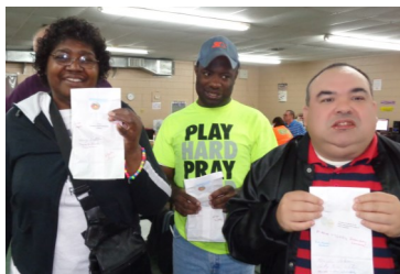
Showing off our bags from Bethany United Methodist Church

on the bags. They thought of everything, even doing some bags with sugar free candy for our diabetics. How thoughtful! We rarely receive any surprise at Easter, so this made our day! Thank you Bethany United Methodist for ALL you do for us! You are such a blessing to us!