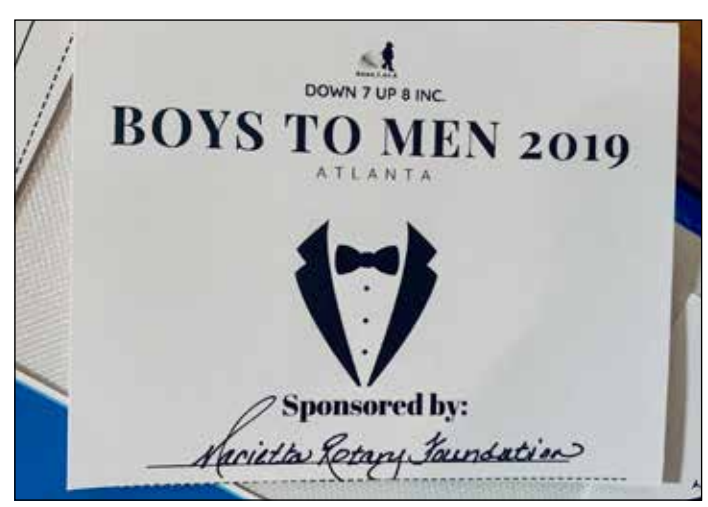
Marietta Rotary a proud sponsor