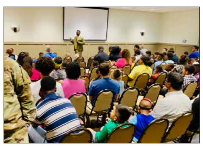
Presentation to the participants