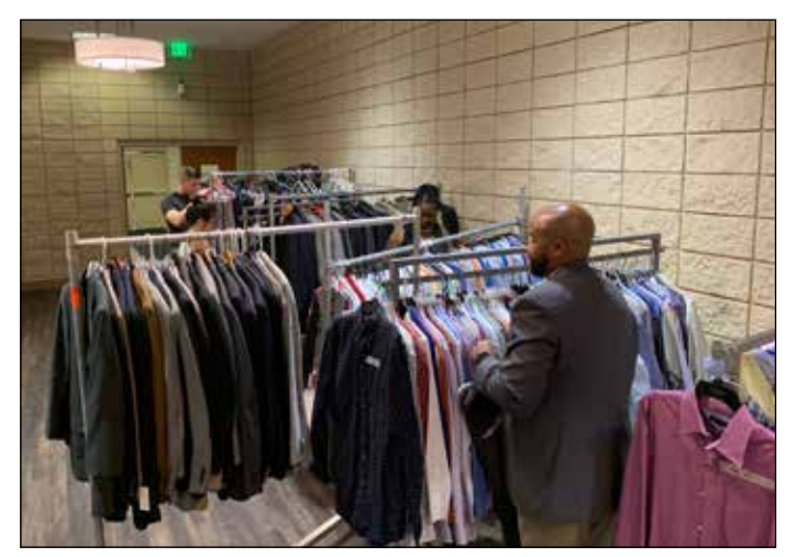
Suits, Coats and shirts for the Men