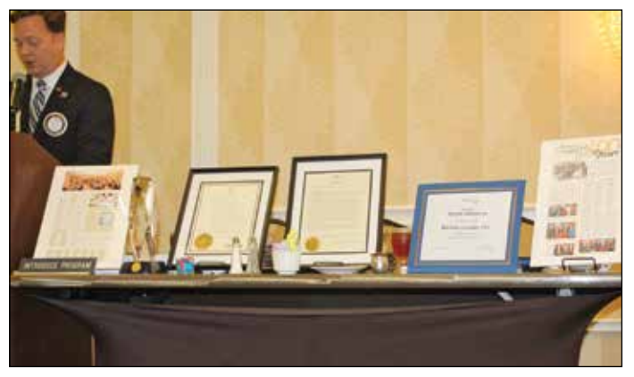
Newspaper articles, Proclamations and awards on display