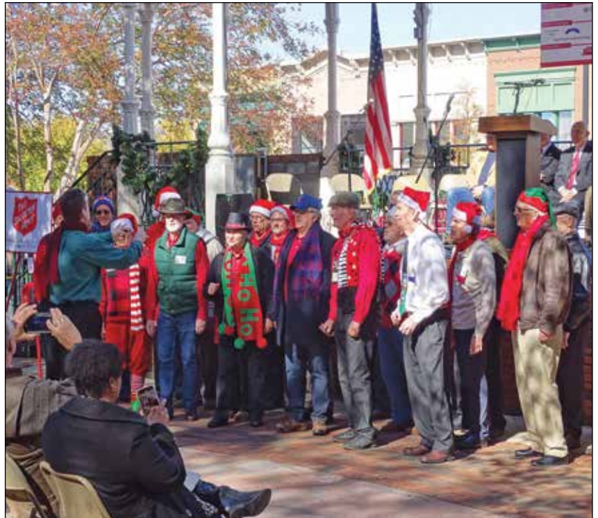
Entertainment was provided by the "Big Chicken" Chorus